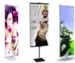
Poly Satin Dye