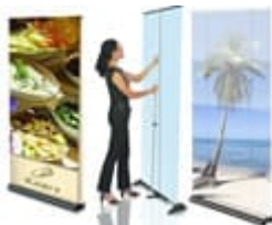
Retractable Banner Stands