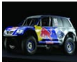
Outdoor Dye Sublimated